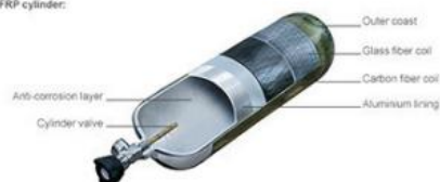
Design of a CFRP cylinder:

Air Cylinders: More robust and safer four-layer composite structure design; aluminum alloy inner bladder; carbon fiber; glass fiber; epoxy resin