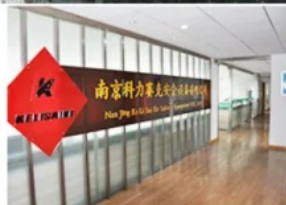
THE OFFICE MEETING