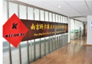
THE OFFICE MEETING