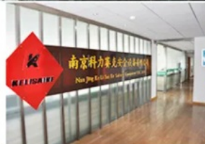
THE OFFICE MEETING